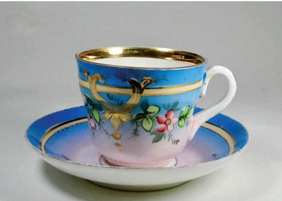
Teacup and saucer, 2011.21.4. Porcelain was one of the most common objects brought to Canada by the Russländer. They were often given as engagement or wedding gifts, and were treasured by their owners and passed down for generations. Often they were not used for practical reasons, but for decorative purposes. Over the years, they became memories of New Russia, and created a link between the old home and the new.

Mennonite Heritage Village's (MHV) upcoming temporary exhibit The Russländer , explores the experiences of the Mennonites who migrated from the Soviet Union to Canada in the 1920s, known as the Russländer. Between 1923 and 1930, almost twenty-five thousand Mennonites fled the Soviet Union in search of safety, security, and economic opportunities. This group, and those who stayed behind, had survived years of violence, war, famine, and disease as a result of the Russian Revolution. Before this time, the Mennonite colonies in New Russia (today Ukraine) had become more prosperous than ever before, and the colonies had become central in agricultural production in Imperial Russia. However, when the empire fell, the world the Mennonites had created in the colonies came to an end. This exhibit looks at the life of the Russländer and Mennonite colonies before the Revolution, their experiences during the Revolution and flight from the Soviet Union, establishing new lives in Canada, and, finally, how this migration has been remembered and memorialized by later generations.