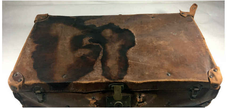
A leather suitcase is one of the artefacts that has had water damage due to the leaking roof in the collections storage room.

So that's the bad news – now for the good: there are many ways you can help MHV fulfill its mission by helping to once again get a solid roof over the Village Centre. We need to raise the full cost of the new roof before it can begin. This $100,000 project is outside the scope of our annual budget, which just covers the cost of our operations for the year. Consider making a donation, over and