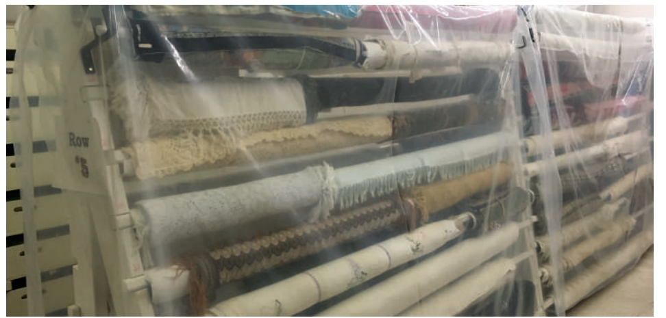
Textiles protected in plastic sheeting in the collections storage room.