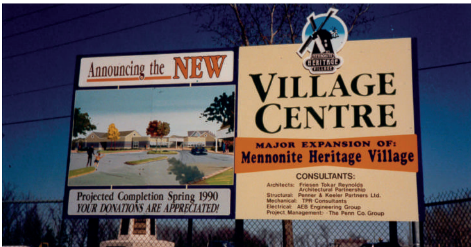
Billboard announcing the new Village Centre, a major expansion of MHV, adding "Your Donations Are Appreciated!"

The roof is original to the Village Centre, which was dedicated on July 14, 1990. It opened under much fanfare and after a large capital campaign designed not only to expand MHV's facilities, but also to allow it to grow and to operate as a professional museum.