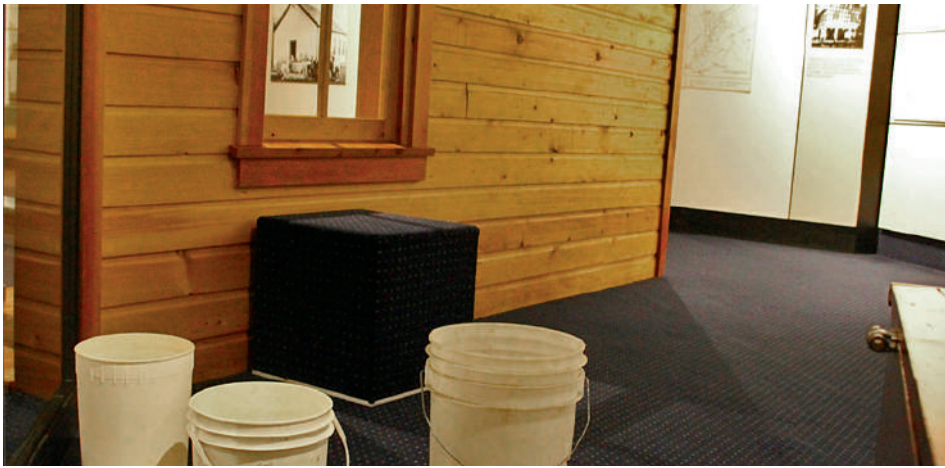
From late January to mid-March, leaks were springing up daily in the Main Gallery.

When we talk about the work of Mennonite Heritage Village (MHV) in public, we often focus on the good: new acquisitions in our artefact collection, upcoming exhibits, exciting Festival Days, new programs for visitors and students alike, and how the museum functions as a community meeting place to bring people together. These are all excellent things that all of us at MHV are very excited to work at and share with the public. This story, however, is not about the positive things happening at MHV. It's about the fact that the roof on the Village Centre is leaking and is in serious need of replacement. This project is urgently needed and carries a price tag of over $100,000.