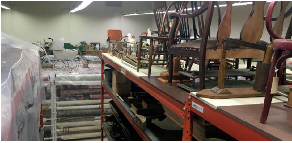
MHV holds a collection of over 16,500 artefacts in trust for the community. Most are stored in the collections storage room (pictured) and many are on display in the Main Gallery, Gerhard Ens Gallery, and throughout the village.

Speaking both figuratively and literally, however, eventually we will run out of buckets to catch all those leaks. The spring melt may be over but the summer rain season will be underway soon. A bucket does not solve the problem of a roof that needs replacing.