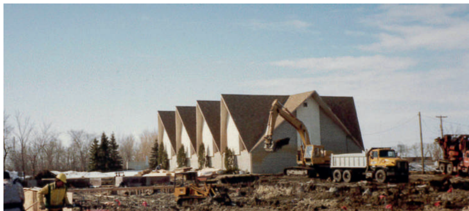
Beginning of construction on the new Village Centre. The building was completed in October 1989, after which the interior, including the Main Gallery, was constructed.

The Village Centre is an excellent facility and the museum has been very well served by the grand vision the MHV Board, staff, and constituency had when they imagined it. The facility they planned was much larger and more extensive than what was immediately required in 1990, but they had the vision to dream and the foresight to plan for a big future.